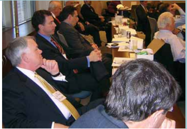
Thirty-five receivers, accountants, attorneys and other receivership professionals attended the multi-state receivership program one of two recent LA/OC Chapter programs.

"Now comes the question as to the nature of the bill before me. If this were a bill asking me merely to appoint a receiver ad interim, ancillary to an ad interim receiver appointed in New Jersey, I should pay no attention to it. But in my view it is a bill asking me to assist in enforcing a final decree made by the Circuit Court for the District of New Jersey, and asking me to gather together assets, or cause them to be gathered together, so that they can ultimately be accounted for where they should ultimately be accounted for; that is, to the Circuit Court for the District of New Jersey. It is like any bill asking the gathering up of assets by an ancillary proceeding for the purpose of causing them to be remitted to be disposed of by the court having jurisdiction at the place of domicile. ■